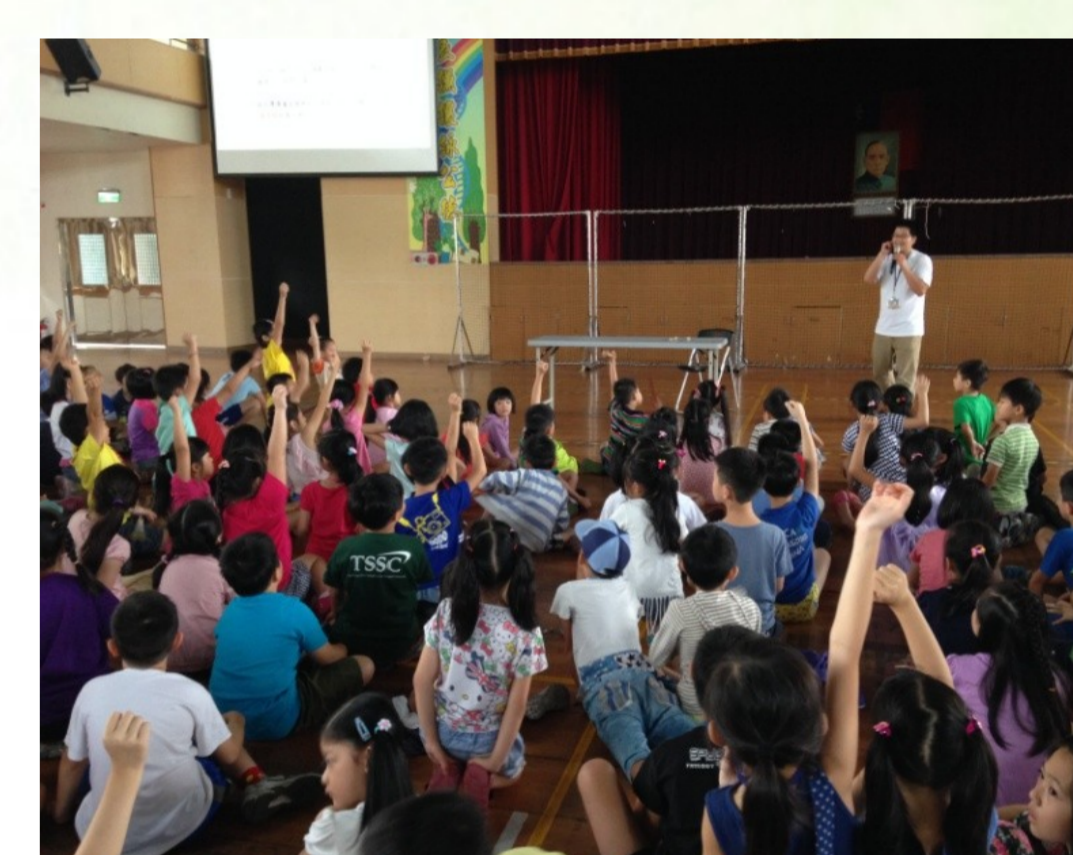
Epidemic infection prevention