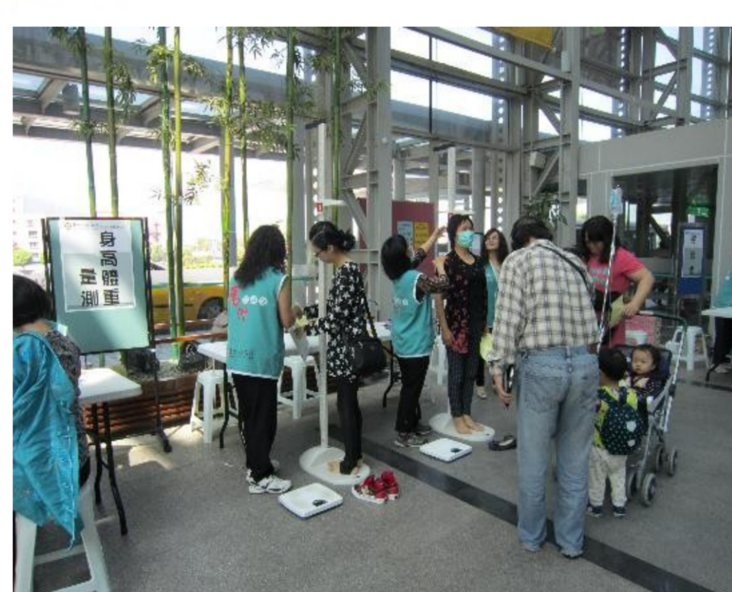
body weight control

In 2015, several issues were promoted by the committee, including health knowledge, health body weight control, cancer prevention, mental health, health counseling, epidemic infection prevention and safety communities. Totally 205 activities was held with 12,737 participants. Compared with last year, the activity grew increased 2.6% and satisfied rate reached 95%. We cooperate with 27 organizations and 281 volunteers to establish health stations which serviced 29,761 people.