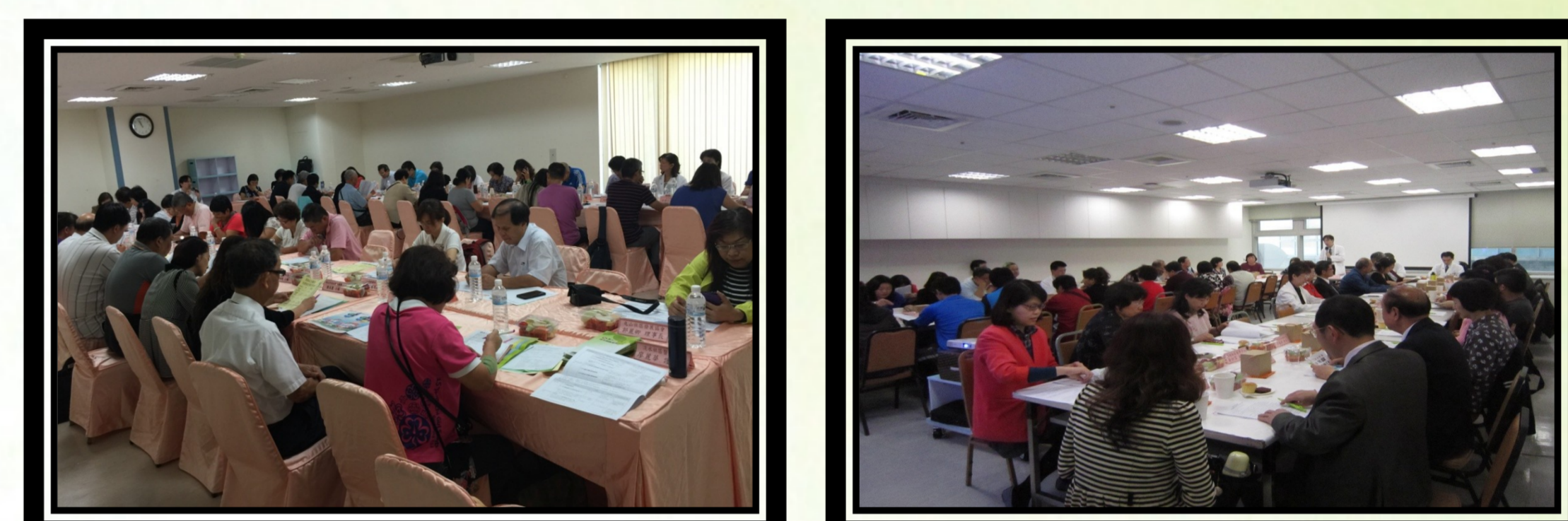
Meeting of Community Health Promotion Committee

The committee members include government public sectors, village offices, the community development association, churches, schools and community building management committee. Currently, 67 organizations participated the committee; covering five administrative districts approximately 500,000 population. Two conferences were held in one year to make annual guidelines, discuss the efficiency and share the results.